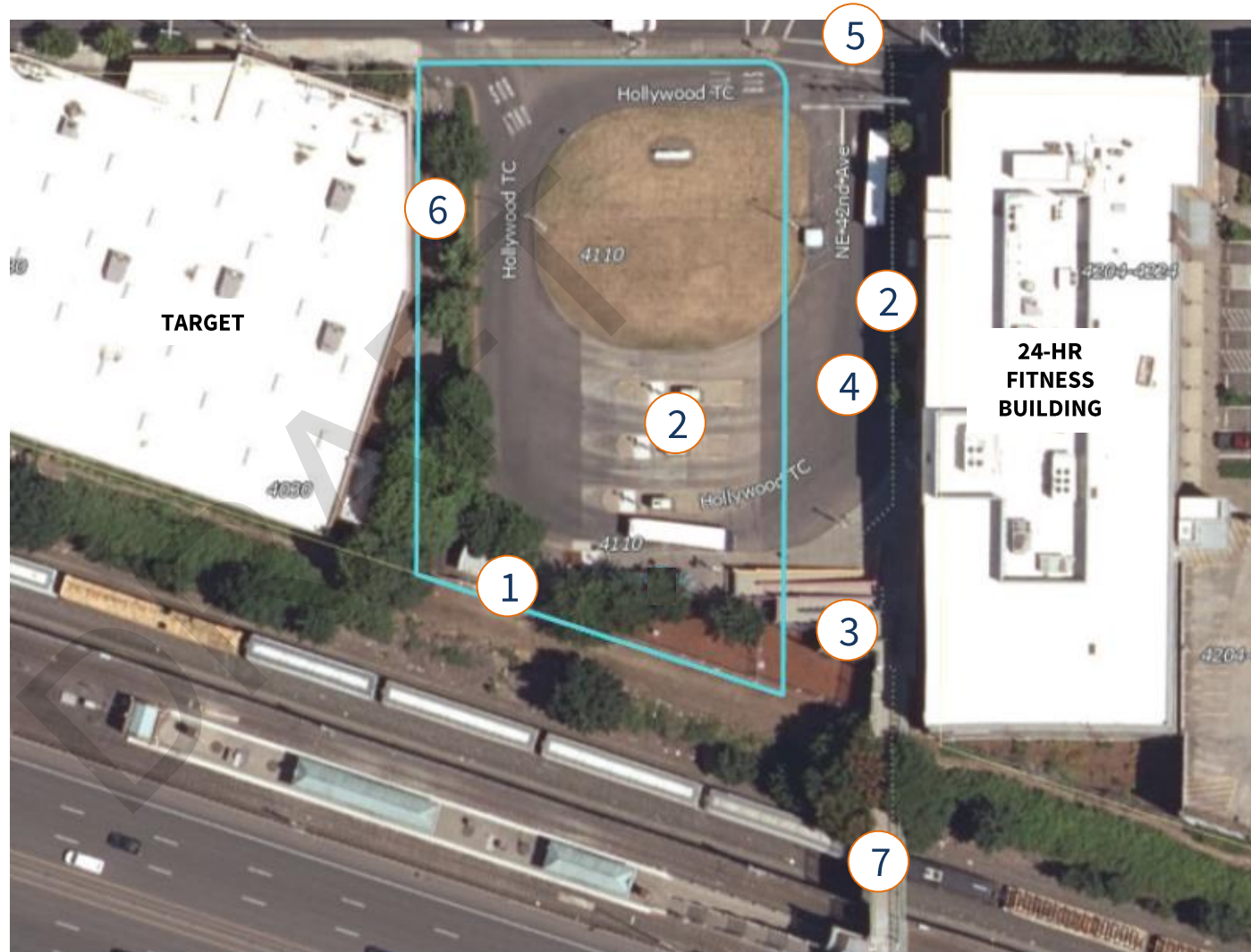
Hollywood Transit Center 4110 NE Halsey Street, Portland OR